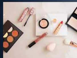
Image Audit & Make Up Workshop